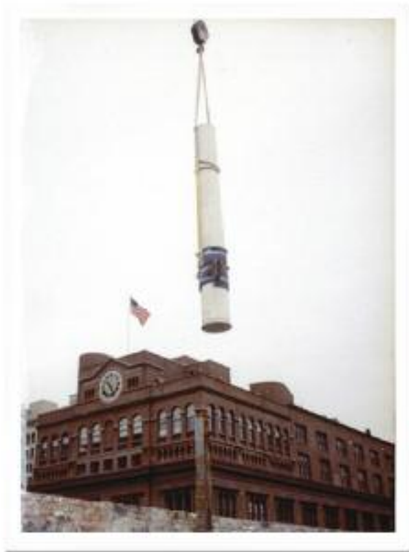
⌘ The column being hoisted out of the Hewitt Building and onto a truck for transportation to Green-Wood.

The Hewitt column is located across from The Cooper-Hewitt family plot, with Peter Cooper's monument at the center and Abram Hewitt's alongside (Lot 3932/37, Sec. 97/101). Tiffany & Co. founder Charles Lewis Tiffany is also interred at Green-Wood, along with his son, stained glass and jewelry designer Louis Comfort Tiffany, in Lot 619, Sec. 65/66. A