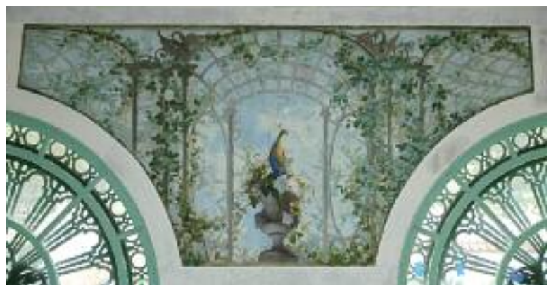
^ The sensational murals by James Wall Finn at Vernon Court. Finn also designed murals for the New York Public Library and the Payne Whitney mansion in New York City.