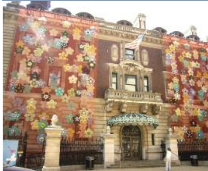
⌘ The Cooper-Hewitt National Design Museum in New York, Spring 2007.