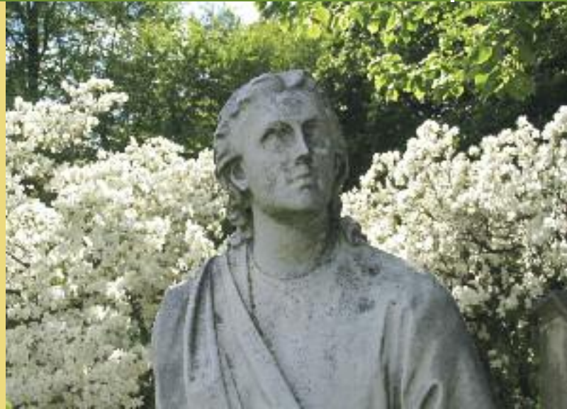
^ Monument and spring azaleas in Green-Wood, May 2008.