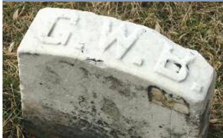
⤎ George Bellows's modest gravestone.

George Bellows is interred at Green-Wood Cemetery in Lot 4728, Sec. 24. A