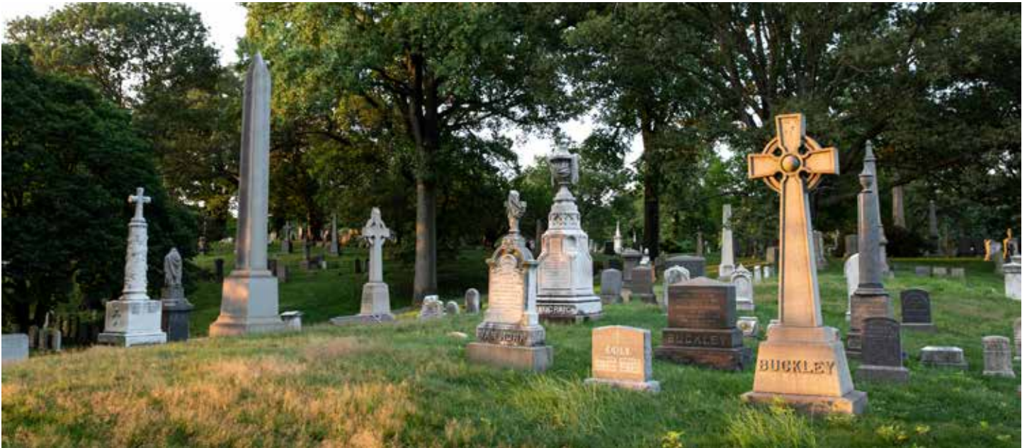
The grasslands of Green-Wood, showing new treatment plans developed in collaboration with Cornell University's School of Integrative Plant Science.

BY JOSEPH CHARAP DIRECTOR OF HORTICULTURE AND CURATOR, DEPARTMENT OF HORTICULTURE