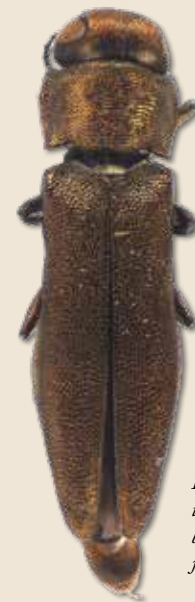
Enlarged image of the newly discovered beetle, which measures just 3.7mm in length.

Since 2016, Green-Wood has participated in initiatives to identify and reduce the populations of invasive insects that wreak havoc on trees both inside and outside of Green-Wood. Our partners in this work are the U.S. Forest Service, U.S. Department of Agriculture, and the New York State Department of Environmental Protection. Green-Wood is proud to help safeguard New York's urban forests.