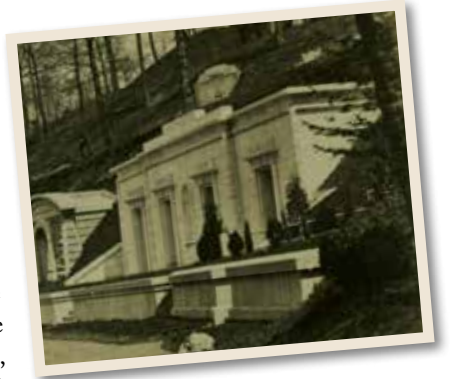
Photograph of the mausoleum circa 1875

In New York City, restoration of historic buildings is booming. Yet, the number of qualified craftspeople to carry out this important work is woefully low. At Green-Wood, we're doing our part to change that. Through the Bridge to Craft Careers program, we present a unique and unexpected educational experience for young job seekers interested in hands-on, outdoor work.