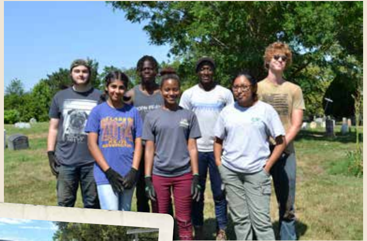
Green-Wood's 2019 Restoration and Preservation student interns.

Green-Wood thanks World Monuments Fund for their generous funding and continued partnership in this venture. We are proud to advocate for cemetery preservation and restoration efforts throughout New York City. We look forward to working with another great group of students in the summer of 2020!