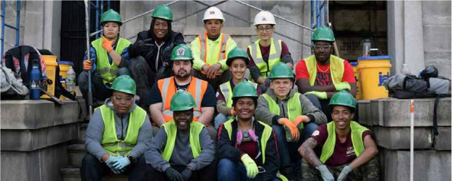
Participants in the 2019 Bridge to Craft Careers program with Green-Wood's Manager of Restoration and Preservation.