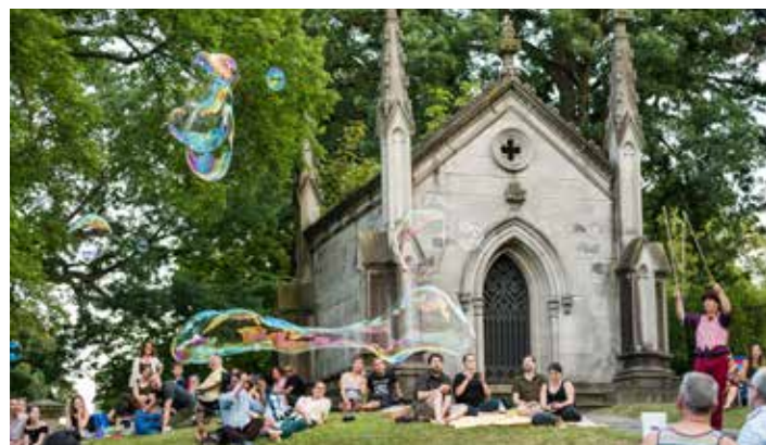
Top to bottom: Visitors gathered before the Arch for a screening by Rooftop Films; A dancer performing at Green-Wood's Nightfall; Visitors enjoying the entertainment at Green-Wood's annual program, Niblo's Garden.