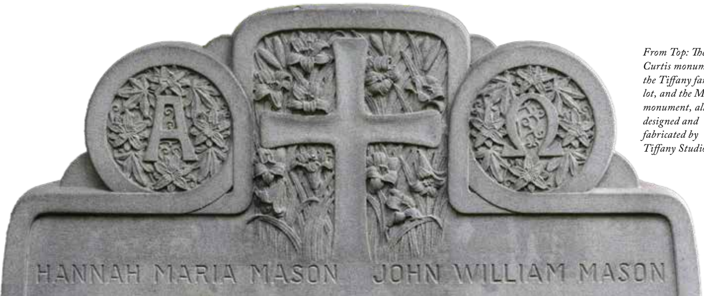
From Top: The Curtis monument, the Tiffany family lot, and the Mason monument, all designed and fabricated by Tiffany Studios.

The project also helped us answer a long standing question: who designed the monuments of the Tiffany family lot? Well, it turns out those were made by Tiffany Studios as well! Discoveries like this are a testament to the knowledge Green-Wood can gain through our connections, volunteer work, and unflinching curiosity.