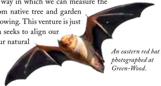
An eastern red bat photographed at Green-Wood.

Green-Wood will use the results of the survey for years to come as we continue to assess our ecosystem. The makeup of our wildlife will provide valuable information about the health of Green-Wood's environment, and a way in which we can measure the success of our landscape practices, from native tree and garden plantings to thoughtful pruning and mowing. This venture is just one way in which Green-Wood's team seeks to align our practices more harmoniously within our natural environment.