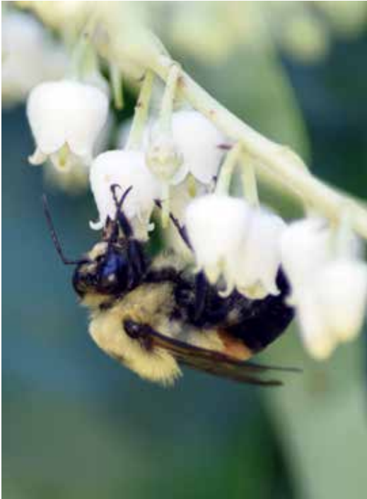
A brown-belted bumblebee collecting nectar from the flowers of one of Green-Wood's sourwood trees.

BY SARA EVANS PROJECT MANAGER, DEPARTMENT OF HORTICULTURE