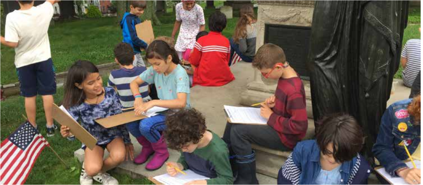
Students from Brooklyn's P.S. 321 participating in one of Green-Wood's school programs.

“THIS WAS ACTUALLY THE BEST FIELD TRIP EVER!” yelled a fourth grader on a recent school program at Green-Wood. Those words are music to an educator's ears. And they are pleasantly surprising considering that student had just spent ninety minutes reading primary source documents and sketching monuments with his classmates—in a cemetery in the rain. We hope to hear those words regularly from now on as Green-Wood revitalizes and expands its school programs.